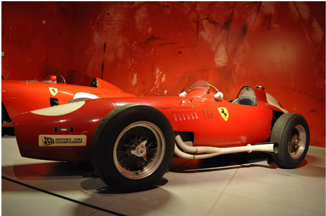
0712 625 GP Monoposto 57 Rosso Corsa/Nero CHD eng. # 0672