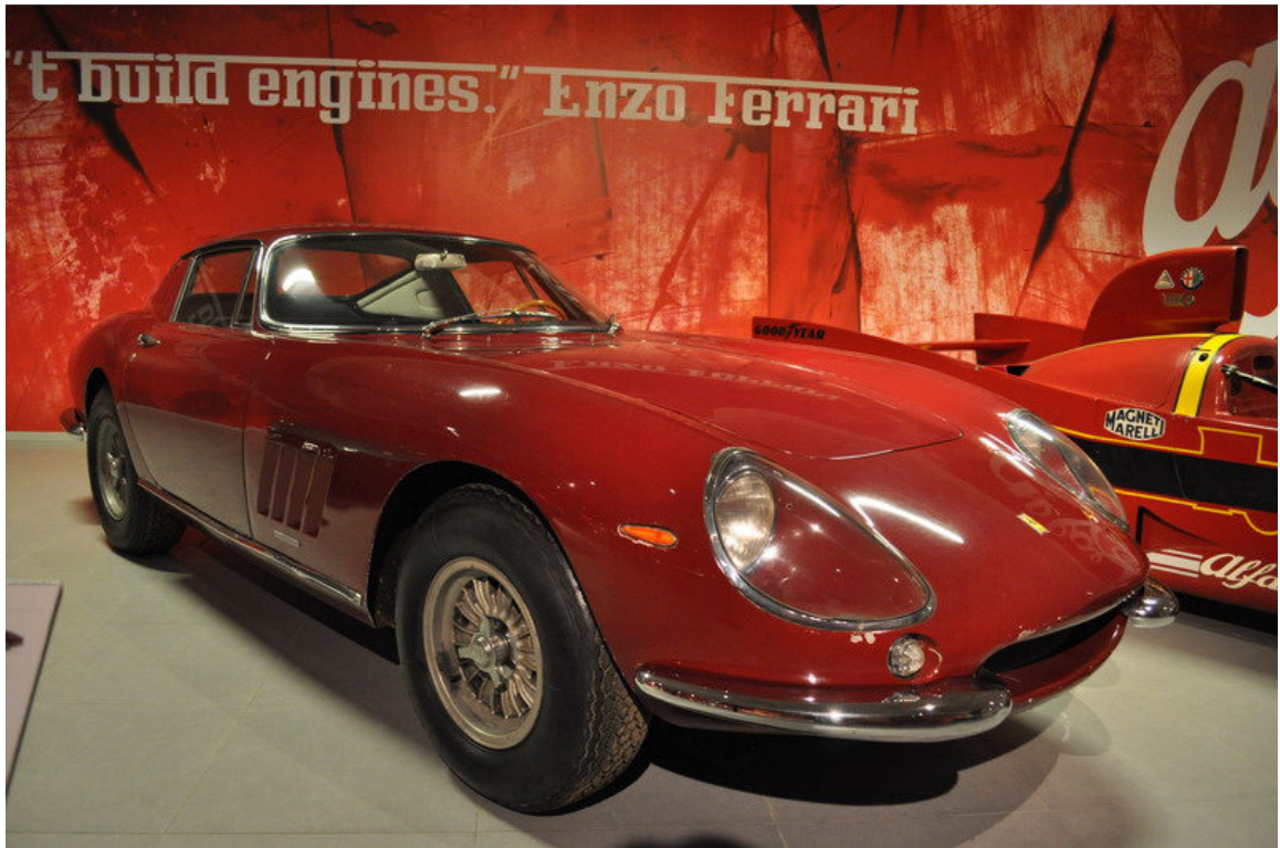
08031 275 GTB/6C #280 65 dark Red/Nero LHD EU int. eng. # 866, Longnose, Alloy