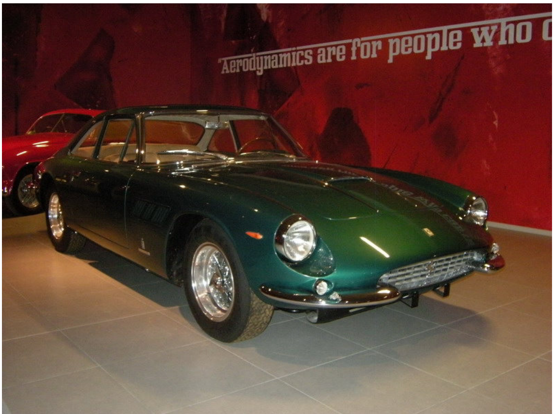
6267SF 330 GT 2+2/500 Superfast #13/37 8/64 Verde Pino Met Italver 20453/Naturale 3218 LHD EU eng. #6267SA PF Job #99592, ex-Prins Bernhard