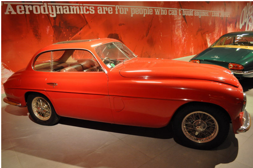
019S 166 Inter Touring Coupe Paris Show Car 49 Rosso Corsa/Brown RHD EU, Aerlux roof, notchback

The absent friend to be mentioned first, S/N 02, the 375 Indianapolis, nicknamed 'Grant Piston Ring Special' was recently on display at Maranello.